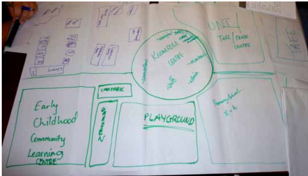
Aboriginal Youth Forum mind maps of what their 'ideal' school looks like